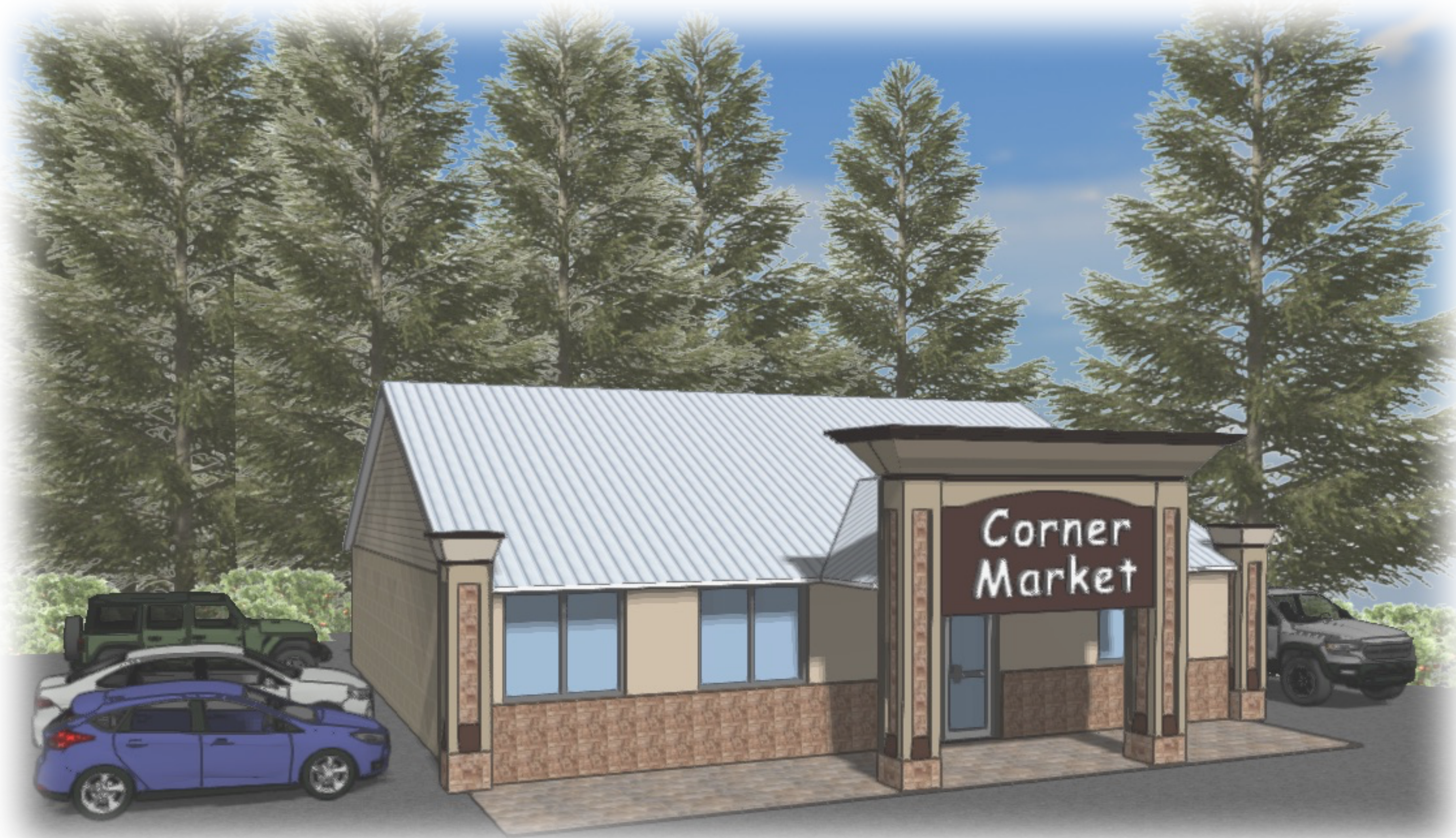
2 Proposed Rendering Scale: 1/4" = 1'-0"