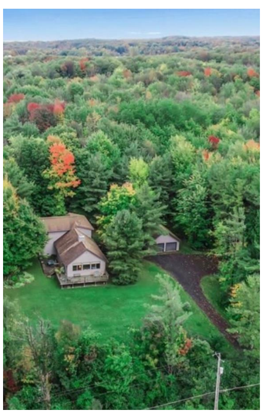
drone view of location