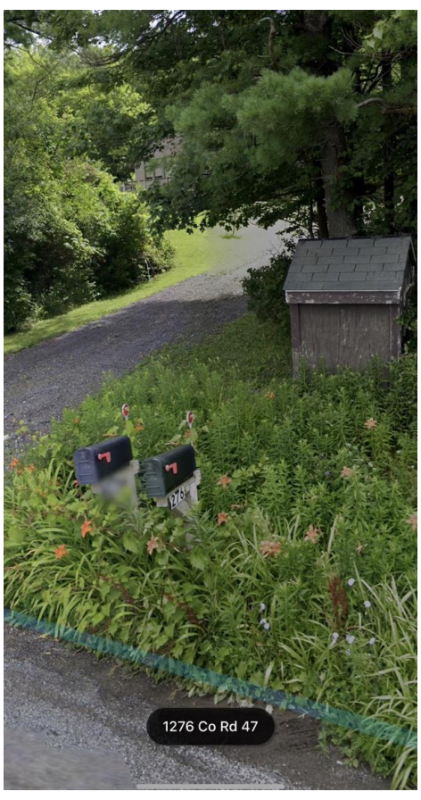
View of bus stop hut