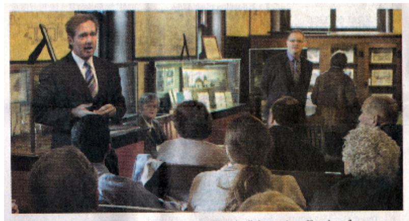
Congressman Brian Higgins addresses participants at a National Preservation Conference field session in East Aurora on Friday. Entitled "East Aurora: Protecting Small-Town