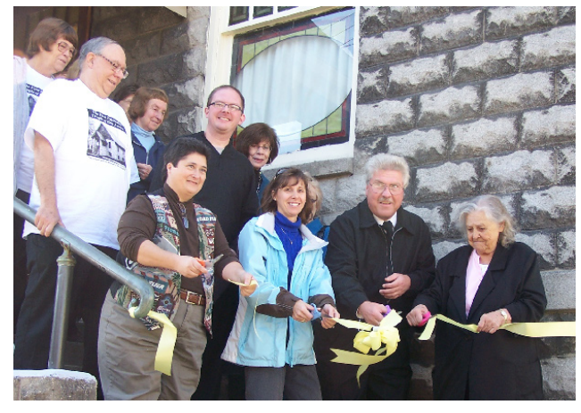
First Spiritualist Temple's 100th anniversary